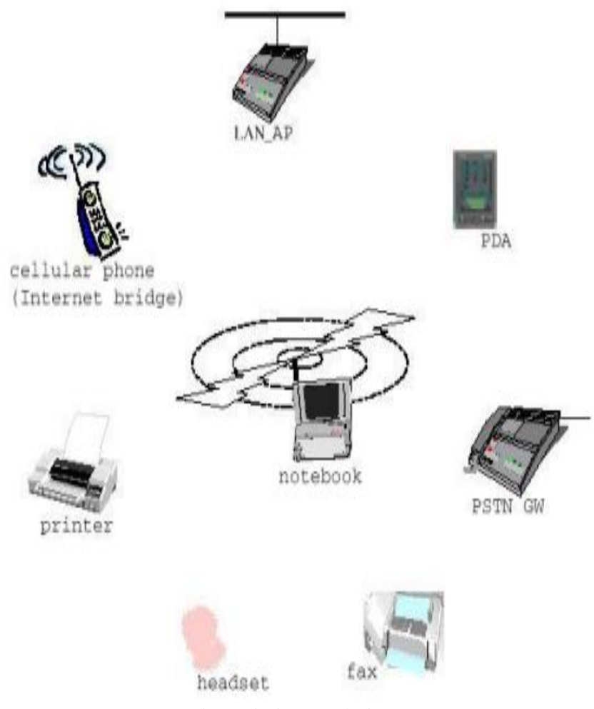
Fig.3. Gi-Fi access devices [12]

developed using a single chip can be integrated with any electronic device or the Home Office used to transfer video quickly high time of 5 Gbps) [1]. In Fig.1, the Gi-Fi access devices are shown.